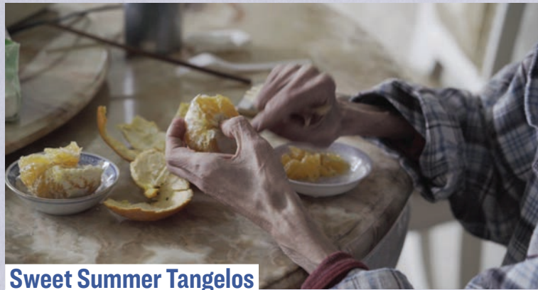
Sweet Summer Tangelos

Welcome to the O.K. Corral—a Wild West historical reenactment theater in Tombstone, Arizona, where a troupe of actors replay the same day in 1881 over and over again. In looking at the past through the lens of the so-called "Town Too Tough To Die," the film explores the power of stories and perils of nostalgia. adamevansfilm.com | aevans@mfasocdoc.com