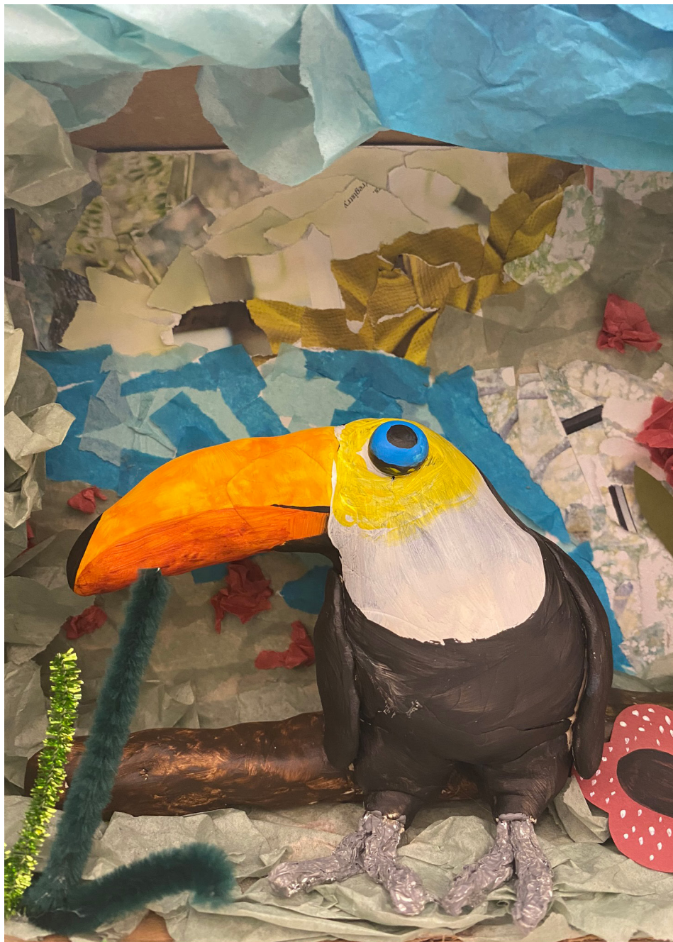
Miranda Jang (MAT 2020), rain forest diorama with paper-mache, integrating art and biology for third grade